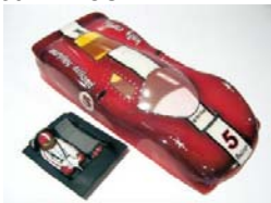
Ferrari 330 P4 – OS 424