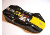
Lotus 40 Outsight Part 450