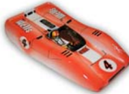
McLaren M8B True Scale TSR 01