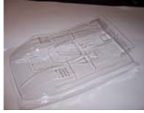
Lola T163-OS 407L