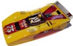
Lola T160-True Scale-TSR 05