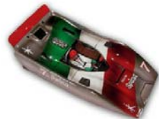
TI22 - Kirby Associated Long OS415L