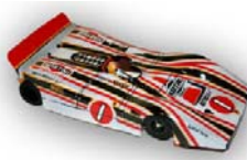
Ferrari 612 TSR 03