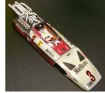
Ferrari Dynamic True Scale TSR 17