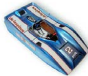
TI22-Kirby - ELEB - 037