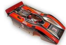
TI22 – Kirby Long True Scale TSR 24