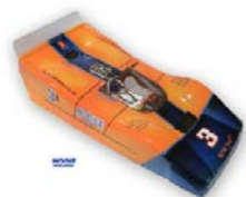
Lola T163 – Parma – 1036