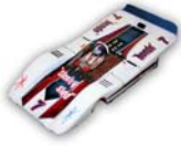
McLaren M8A VINTAGE OS 463