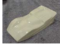
McLaren M6A VINTAGE OS 466