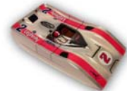
TI22 Short ED V03