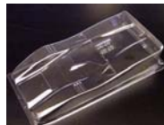
McLaren MK6 VK – ED – MES01