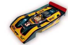
TI22 –Long OS 408L