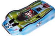
Shelby King Cobra Toy Tech TR180