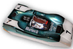
Lola T163 Vintage OS 464