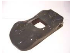
Lotus 40 – OS 472