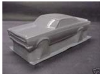
67 Ford Fairlane OS 602