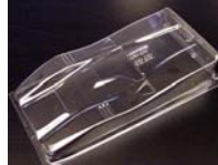
McLaren M8 Lancer ED ELEB 03