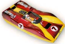
Lola T160-Electric Dreams-MACV15