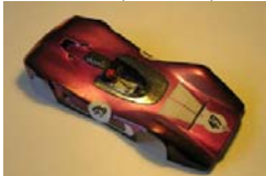
Lola T-163 Howmet (Dilworth)