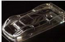
Ford GT MKIV True Scale TSR26