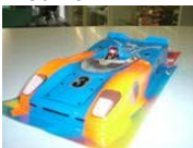
Porsche 908 Red Fox