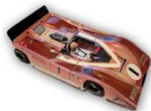
TI22 Short OS