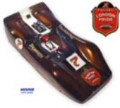
Lola T-160 Mini Wheels Howmet (Dilworth)