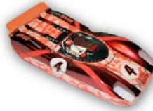
Porsche 908 VINTAGE OS 456