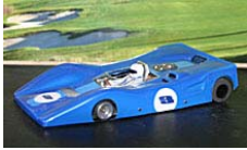
Lola T160-Toy Tech-TR 195