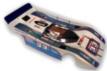
TI22 JK 7081B