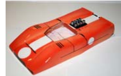
McLaren M8 OS 413