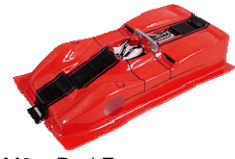
McLaren M6 – JK – 7087B