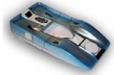
TI22 – Kirby True Scale