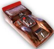
McLeagle OS 409