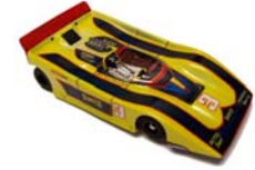
TI22 – Kirby – G-Force -GFR100B